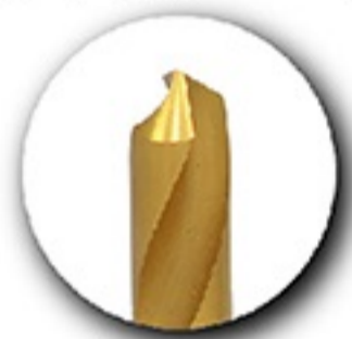
90° NC 定位鑽