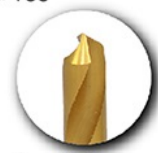
90° NC Spotting Drill