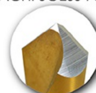
90° NC 定位鑽 (2面) 鋼用