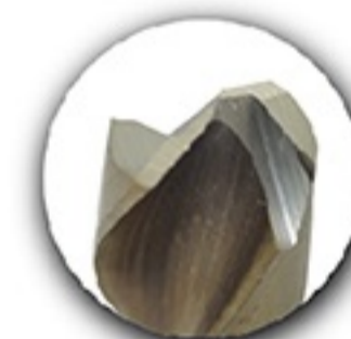
SGESS 7572P 高速鑽頭