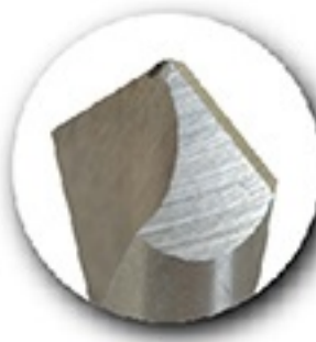
90° NC Spotting Drill (2 Facet) (For ALU.)