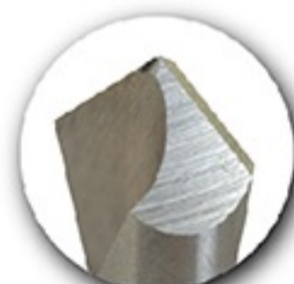
90° NC 定位鑽 (2面) (鋁用)