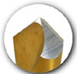
90° NC Spotting Drill (2 Facet) (For Steel)