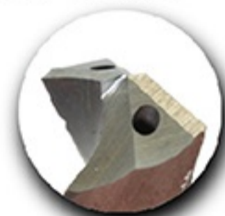
高速鑽頭(3面) NACHI SGESS 7570P