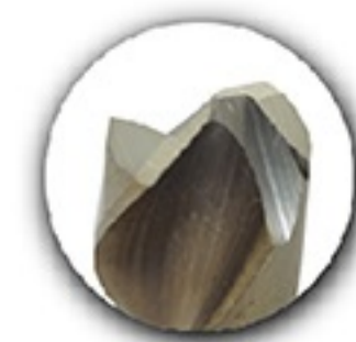
SGESS 7572P High Speed Drill