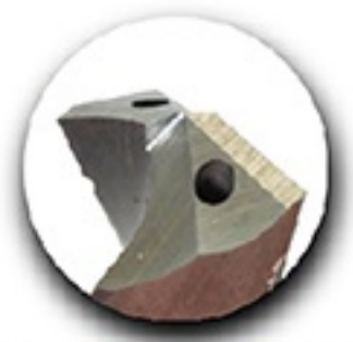
High Speed Drill(3 Facet) NACHI SGESS 7570P