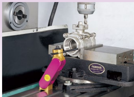
定位器應用 Typical Application