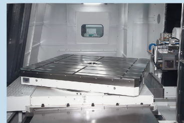
分度盤 CNC rotary table