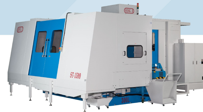
全罩板金 Fully guard