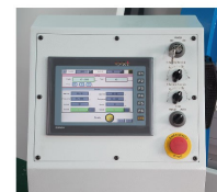
人機操作介面 HMI control panel