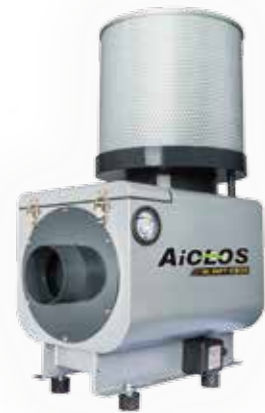
Oil Mist Collectors & Air Cleaner