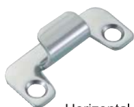
平面鉤 Horizontal Keeper