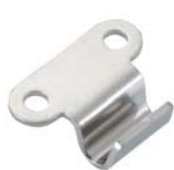
垂直式短鉤 Vertical Keeper (Short) CT-0120-4 CS-0120-4