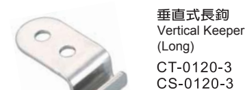
垂直式長鉤 Vertical Keeper (Long) CT-0120-3 CS-0120-3