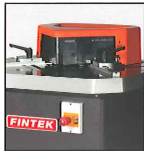
SAFETY POWER ON/OFF.