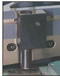
LATERAL MECHANICAL HOLDDOWN IS STANDARD EQUIPMENT.