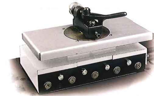
Flange Attachment (STANDARD FOR L-24)