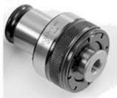
Torsion Collet (protect screw tap)